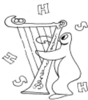
Fig. 39 Harp Seal