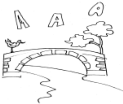
Fig. 5 Abridge