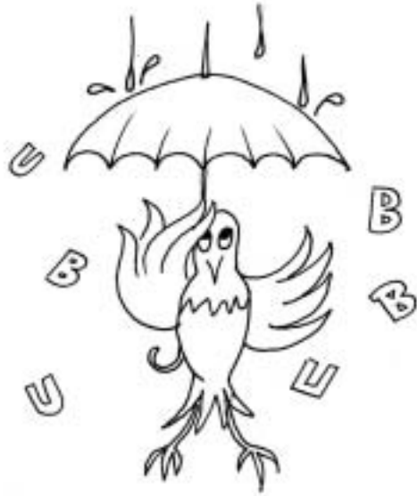
Fig. 59 Umbrella Bird