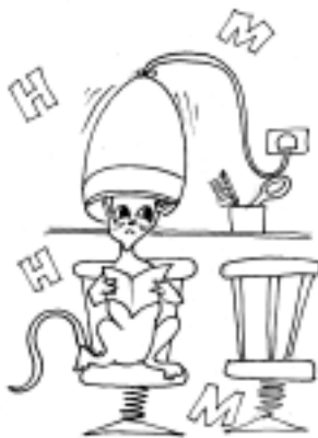
Fig. 38 Hair Mouse